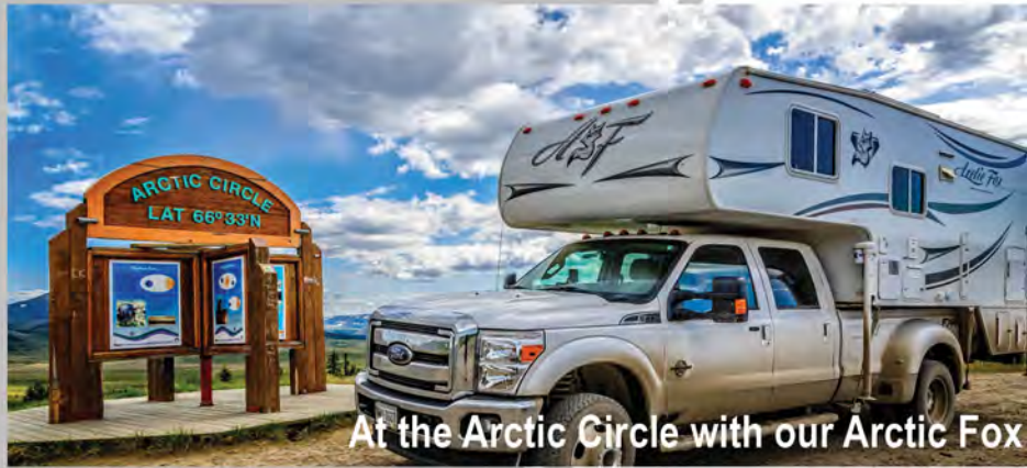
At the Arctic Circle with our Arctic Fox