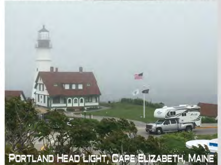
PORTLAND HEAD LIGHT, CAPE ELIZABETH, MAINE

Customer photos and testimonials do not necessarily reflect the views or recommendations of Northwood Manufacturing