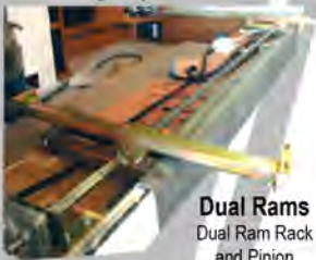
Dual Rams Dual Ram Rack and Pinion Slide Assembly in All Slide Outs