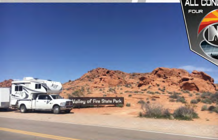
Valley of Fire State Park