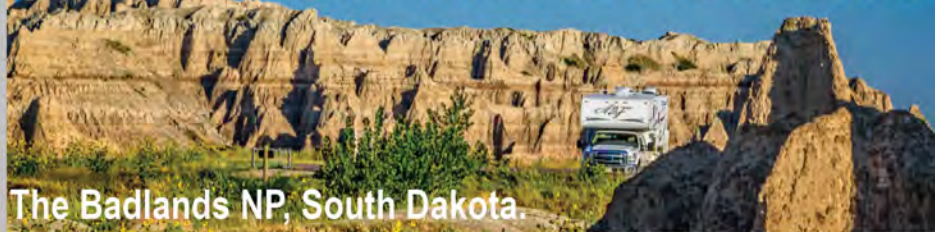
The Badlands NP, South Dakota.