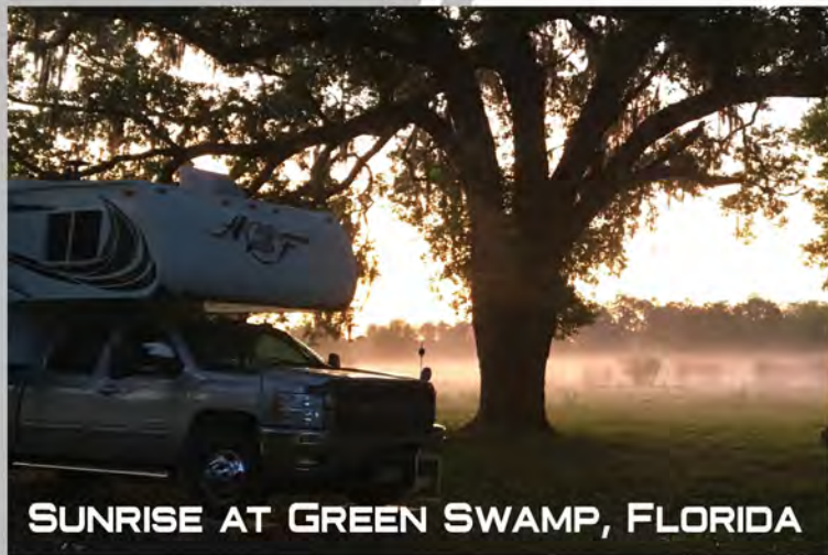
SUNRISE AT GREEN SWAMP, FLORIDA

We bought our first truck camper with the intention of traveling to Alaska and selling it upon our return to the lower 48 States. However, our experience with the truck camper was so good that we decided to make it our summer travel camping vehicle. In September 2018, we traded in our first truck camper for our Arctic Fox 990. Among the reasons we chose to change units are Arctic Fox's 4 Season Package, the location of the slide room on the 990, and the ability to access the camper with the slide in.