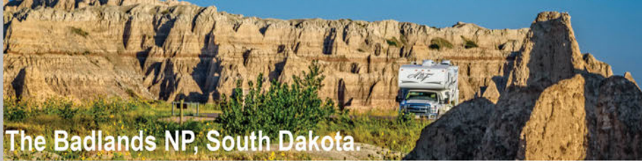
The Badlands NP, South Dakota.