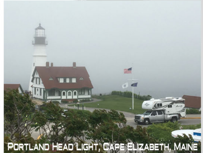
PORTLAND HEAD LIGHT, CAPE ELIZABETH, MAINE