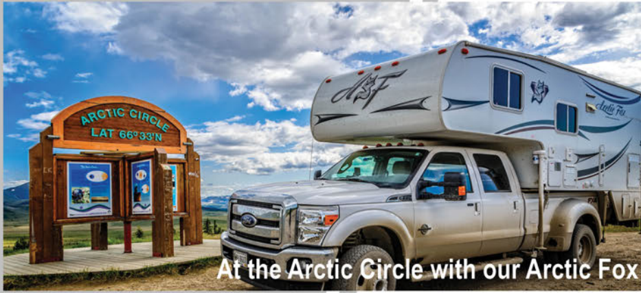
At the Arctic Circle with our Arctic Fox