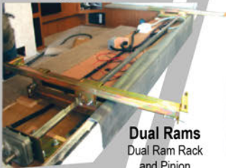
Dual Rams Dual Ram Rack and Pinion Slide Assembly in All Slide Outs