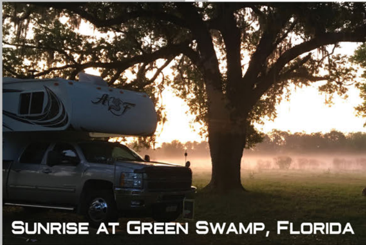
SUNRISE AT GREEN SWAMP, FLORIDA

We bought our first truck camper with the intention of traveling to Alaska and selling it upon our return to the lower 48 States. However, our experience with the truck camper was so good that we decided to make it our summer travel camping vehicle. In September 2018, we traded in our first truck camper for our Arctic Fox 990. Among the reasons we chose to change units are Arctic Fox's 4 Season Package, the location of the slide room on the 990, and the ability to access the camper with the slide in.