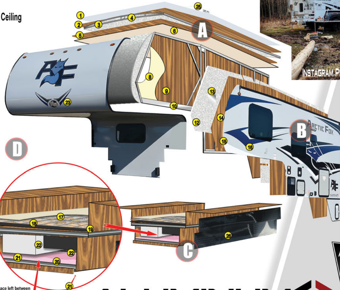
Air space left between tanks and bottom to protect against freezing