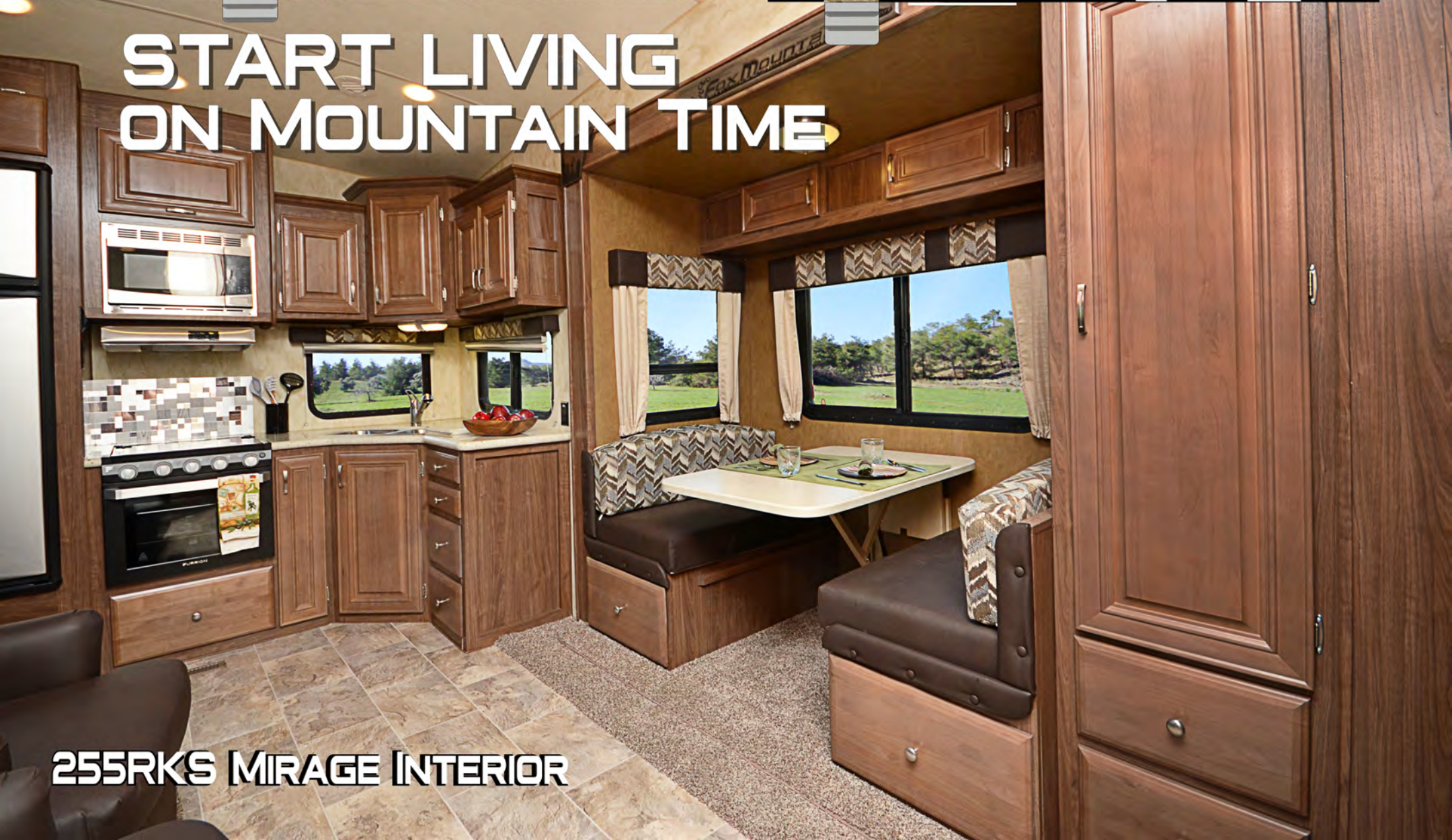
255RKS MIRAGE INTERIOR