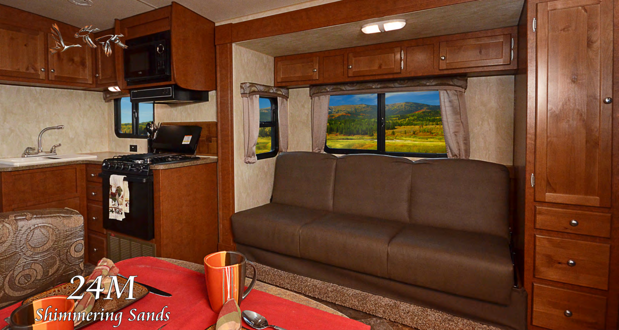
24M Shimmering Sands