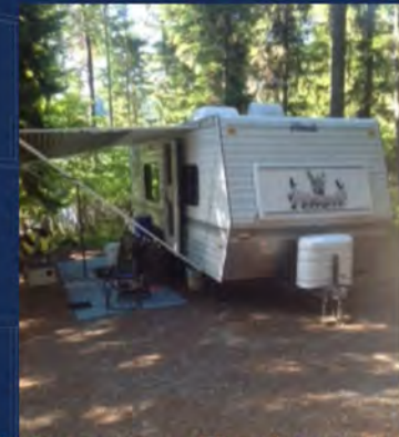
Non-Veh. E. in Ceiling In Foot-7 Side