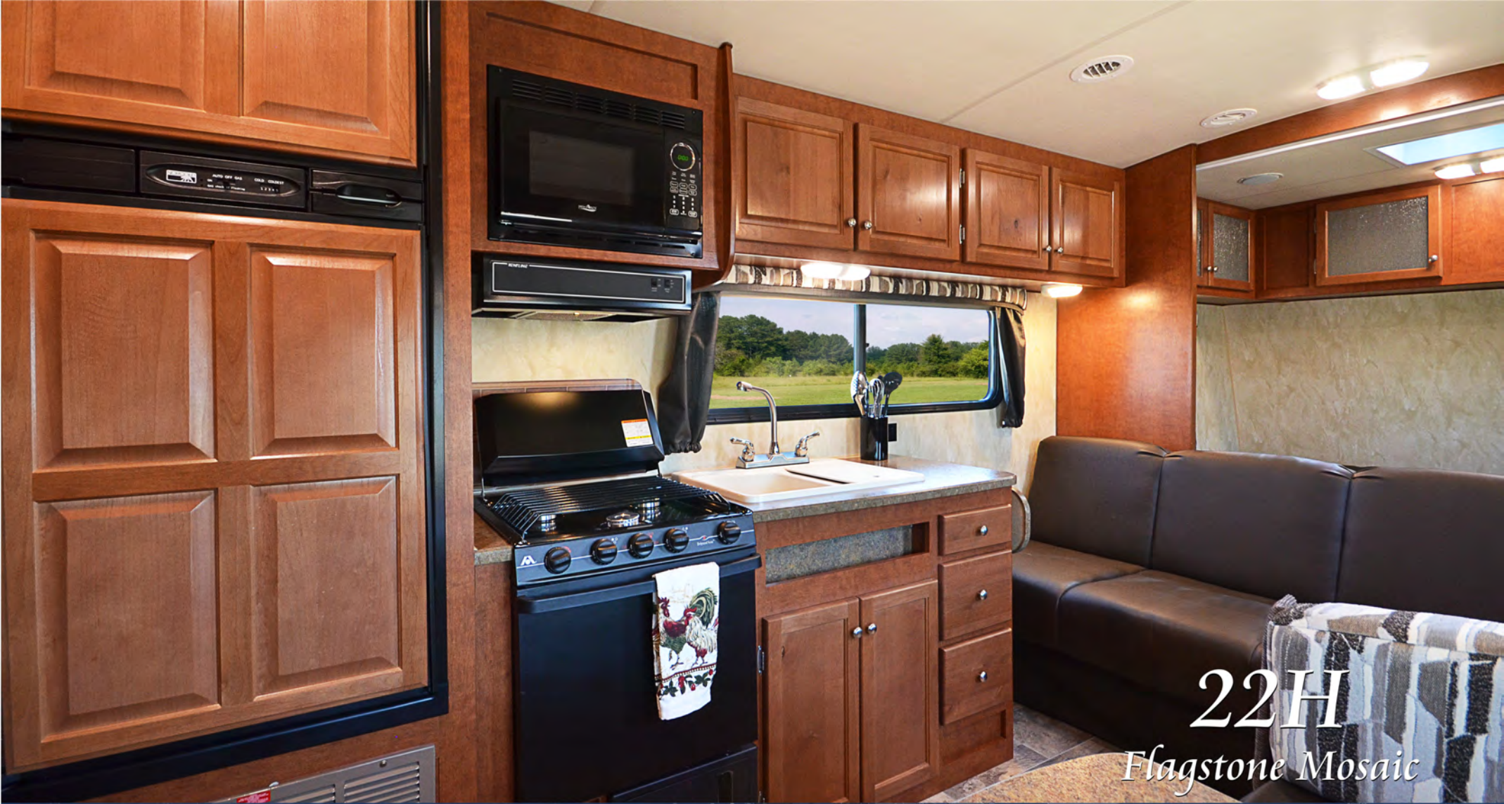
22H Flagstone Mosaic