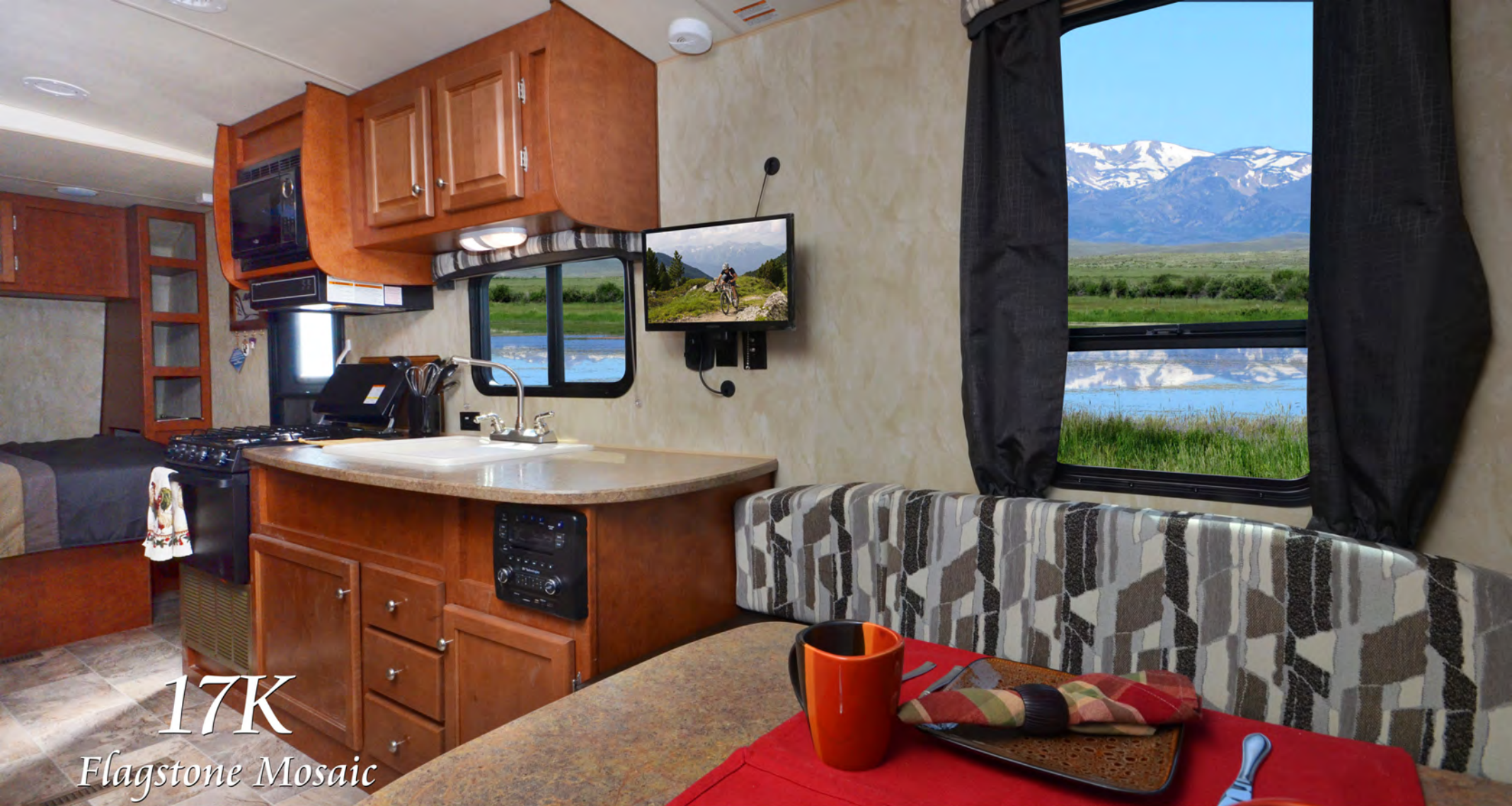
17K Flagstone Mosaic