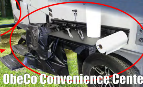
ObeCo Convenience Center

Multi-function work center for the outdoor chef! Spacious work surface with under side storage basket for all your BBQ tools, paper towel dispenser rack and trash bag holder. A great combination when used with the Aussie Grill!